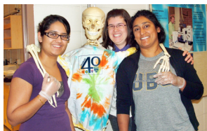
Nursing Students with dressed-up skeleton