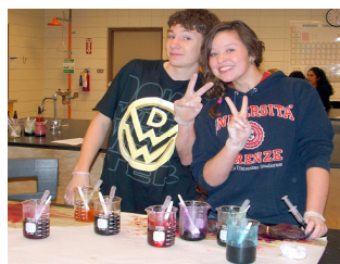
Two highschool students in the midst of tie-dyeing