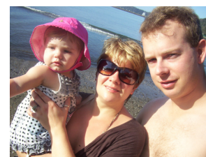
My family and I in Costa Rica

http:// collegechemi- stry- canada.ca/pages/ awards.html