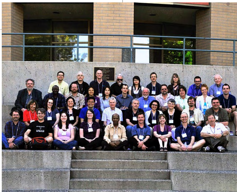
Group Photo of 37th Conference attendees

"We must remember that one determined person can make a significant difference, and that a small group of determined people can change the course of history." Sonia Johnson