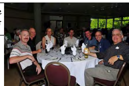
Fun at the Banquet