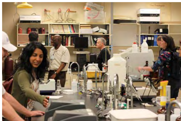
Chem Lab Tour at the College