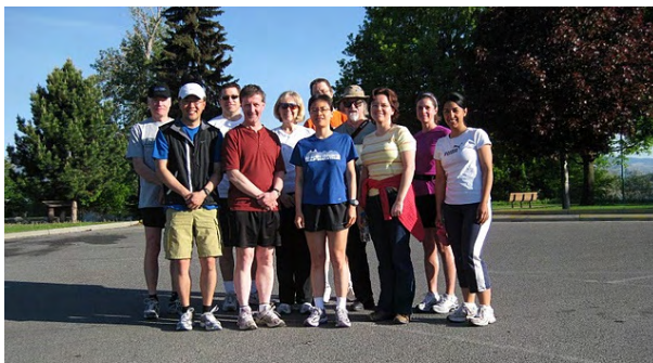
Fun Run 2010

"We must remember that one determined person can make a significant difference, and that a small group of determined people can change the course of history." Sonia Johnson